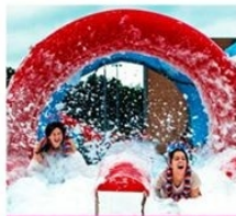
FOAM OF FURY