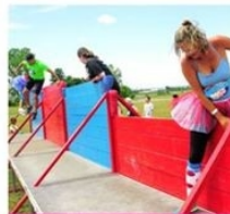
GET IT UP (AND OVER)