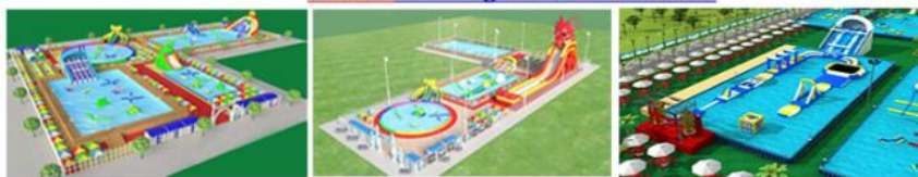
Custom Amusement Theme Parks