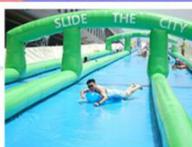
Slide the City