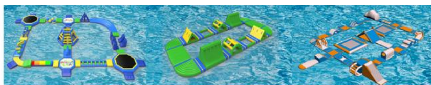
Custom Floating Water Park Games

For Large Projects, we offer totally free service in Site Planning and Projects Design. you can just tell us what's your project plan, and we help custom design every detail parts,Including projects of Floating water park,Inflatable amusement theme parks,Slide the city,Obstacle course, Combos bouncers with slides ,etc.By the way, SIDE THE CITY and OBSTACLE COURSE 5K are popular all around the world,if you have ideas about these project,it is commercial storm that you can get more benefit.