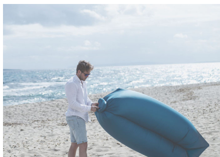
USE FOR BENCH

Any color you want is ok.The inflatable lazy bag have 2 kinds,one can be used for the water,another not.