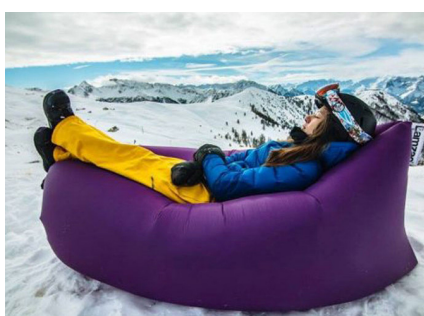
USE FOR HIKING