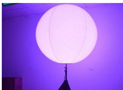
Pink LED stand