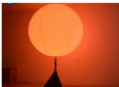
Orange LED stand