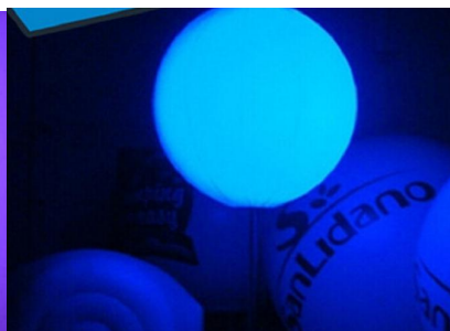
Blue LED stand