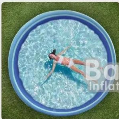
Family swimming pool