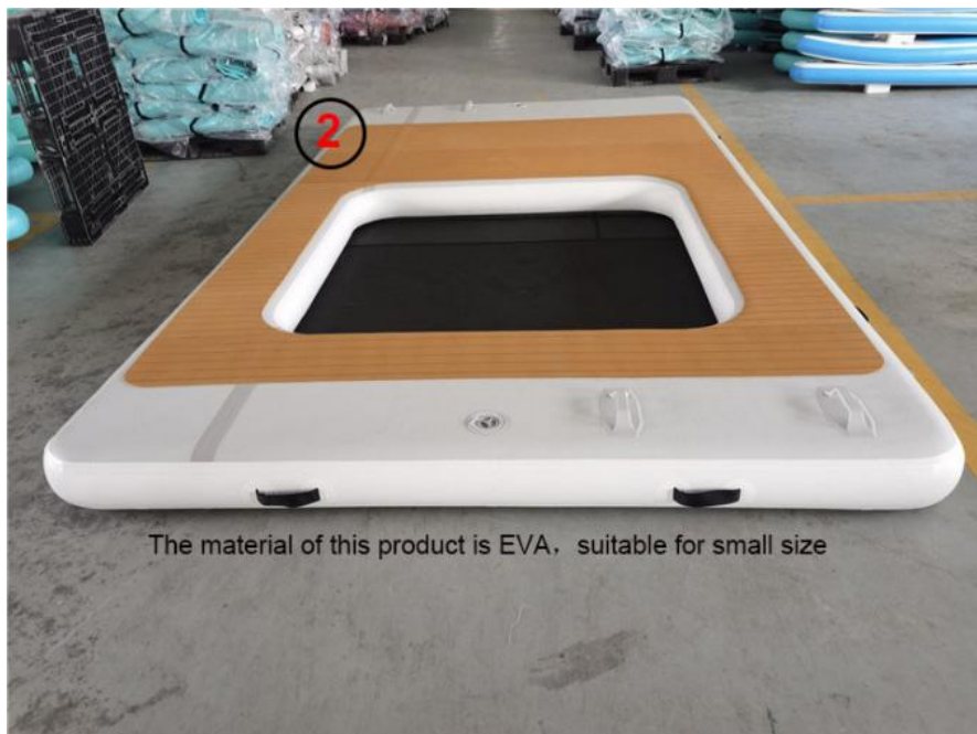
The material of this product is EVA, suitable for small size