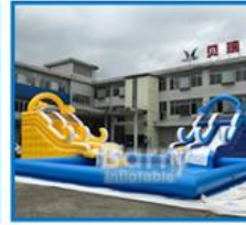
All size/color/shape custom made,contact us