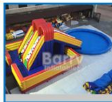
Mat:9x9m slide:11x4.5x7m Pool:dia 10m