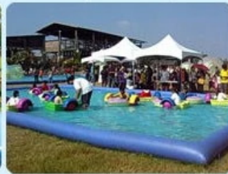
Padder Boat Pool

If you are interested in any inflatable products, contact us for quick response! 24 hours online support available!