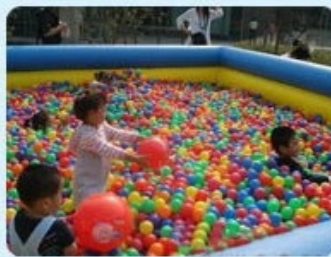
Ocean Ball Pool