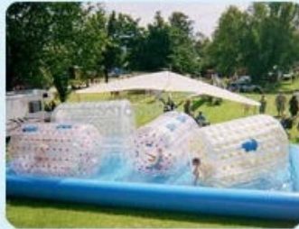
Water Roller Tank