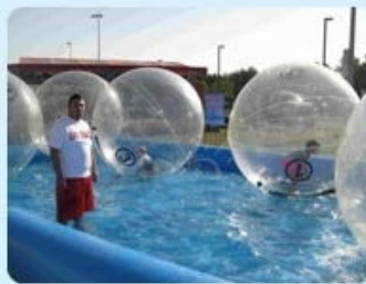
Water Ball Pool