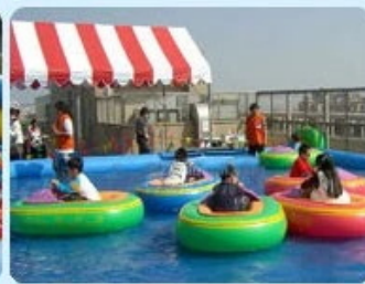
Bumper Boat pool