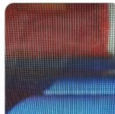
Finger Proof Mesh