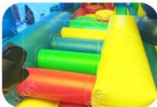
Barrier Pipe Connection Reinforcement