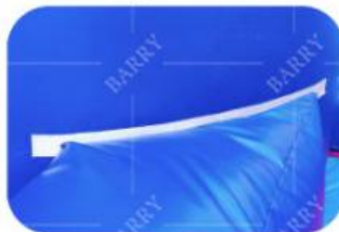
Irregular Railing Upper Side Webbing Reinforcement