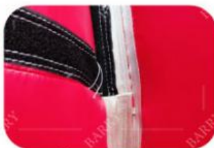
Strength Cross Tube Upper Side Webbing Reinforcement