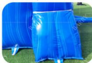
Slide Side Webbing Reinforcement