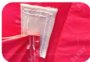
Connection Bar Railing Webbing Reinforcement