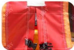
Entrance Single Cloth Webbing Reinforcement