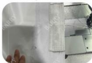
Inner Seam Webbing Reinforcement