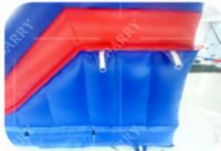
Side And Enclosure Reinforcement