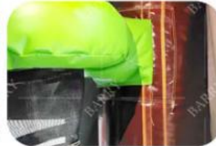
Ball Basket Reinforcement