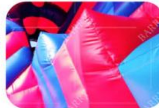
Split-level corner Reinforcement

The connection part and all stress-bearing places are reinforced with protective strips. Avoid damage caused by uneven force.