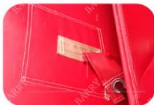
Connection Webbing Reinforcement