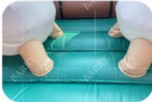
Large Surface Reinforcement

Quality requirements for products should not vary depending on the size of the product and the number of people it can carry. High-quality physical images can not only enhance the beauty of the design, but also extend the use of the product and bring you continuous and substantial income instead of spending time repairing the product.