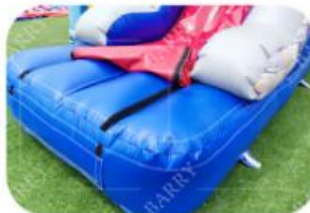
Stress Point Reinforcement