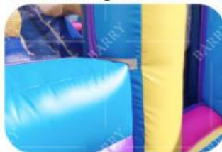
Column Corner Webbing Reinforcement