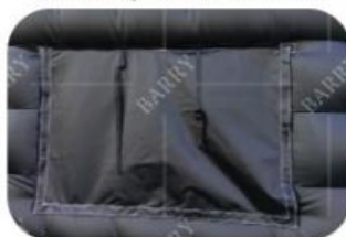
Window Single Cloth Corner Webbing Reinforcement