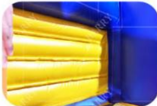
Semi-inflatable Bottom Pool Reinforcement