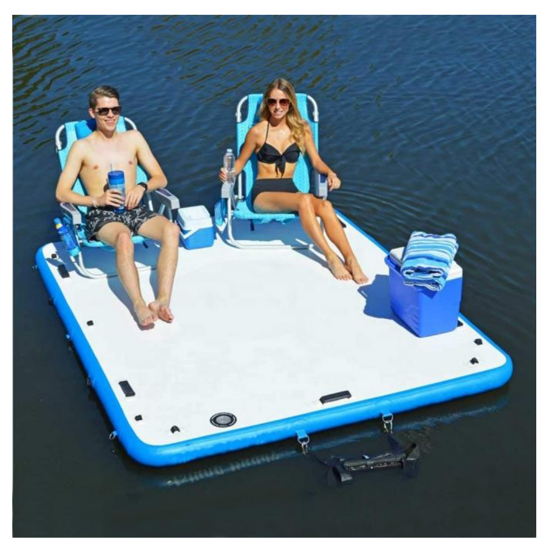
2.Jetski dock By simply connecting any two platforms in a T-shape, you're able to configure your own jet-ski dock. This limits any damage to transoms and jet-skis, as well as providing a safer, easier transfer for yourself and your guests.