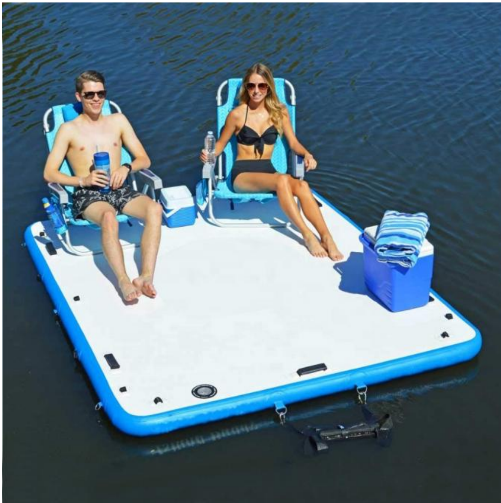
2.Jetski dock By simply connecting any two platforms in a T-shape, you're able to configure your own jet-ski dock. This limits any damage to transoms and jet-skis, as well as providing a safer, easier transfer for yourself and your guests.