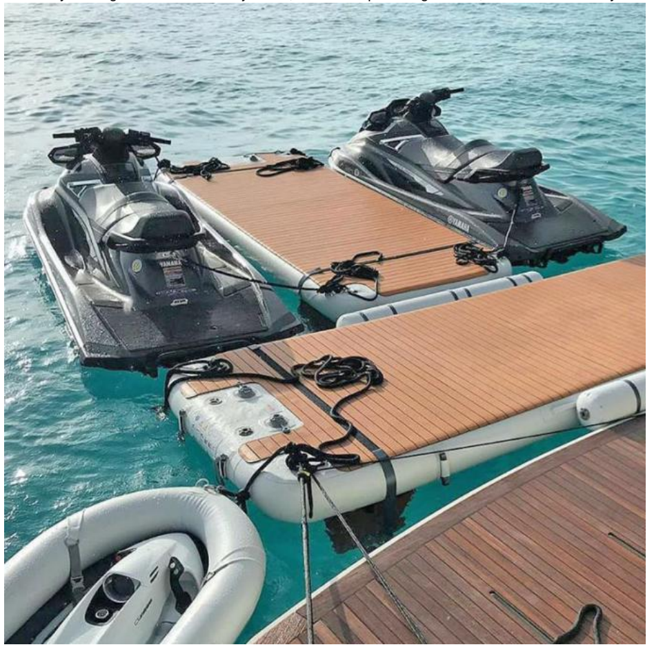
3. Maintenance raft A solid inflatable maintenance tool. your crew can easily clean, varnish, paint, polish and have the hull