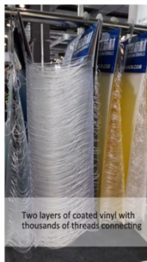
Two layers of coated vinyl with thousands of threads connecting