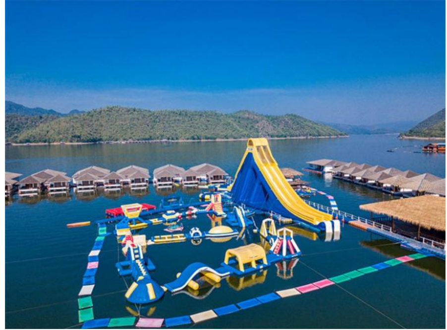
Sea: The inflatable water obstacle course by Barry is perfect for the sea. It provides a challenging and thrilling experience for people who love adventure and water sports.