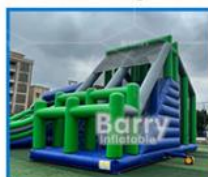
14 Jumping Tower