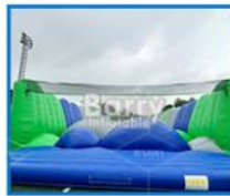
06 Jump Around