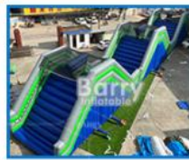
08 The Humps