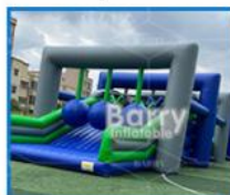
10 Wrecking Ball