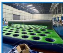
09 Mattress Run