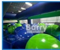
07 Big Balls