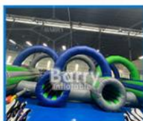
13 Crawling Tunnel