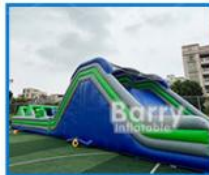
03 Sling Shot