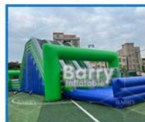
11 Finish Line