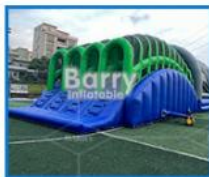
05 the Mad House