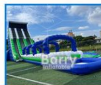
16 Giant Water Slide

This 5k obstacle is composed of 16 obstacles, you can choose one or add more, MOQ: 1PCS, Contact us and share more cases with you/Barry inflatable factory with 20 years.send inquiry.