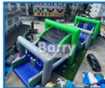
02 Crash Course