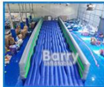
04 Wave Runner