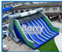
01 Start Line

The 5k is produced in our factory,below is the real pictures in Our factory, we test every inflatables before shiping,the quality is the firstly.