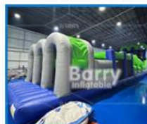
12 Add what you want