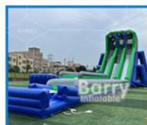
15 tripod Water Slide