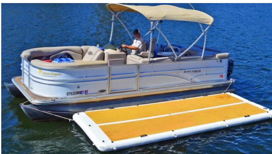
The inflatable dock produce in Barry factory.