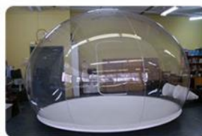
One Room With One Tunnel