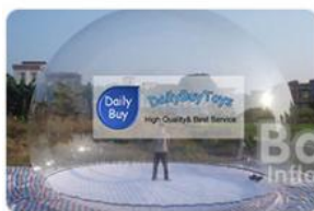
One Room Without Tunnel