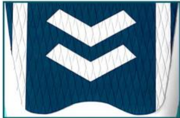
Anti-slip EVA Mat