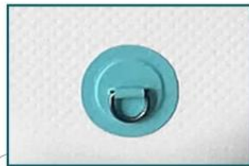
Leash D Ring