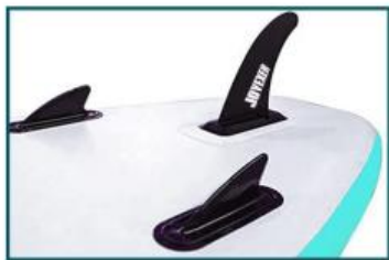
Balance Fins (1 Removeable Main fin +2 Side fins)