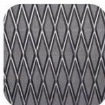
Diamond Molded Pattern