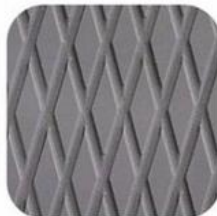
Moulded Diamond Grooved