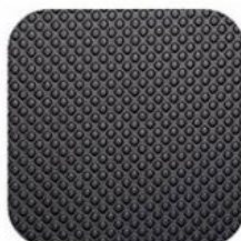
Small Dot Embossed