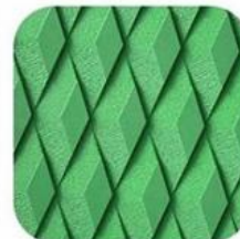
Cut Big Diamond Grooved