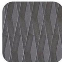
Cut Big Diamond Grooved