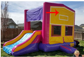
Banner with Magic Tape