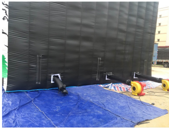
Durable Zipper and S Air Value