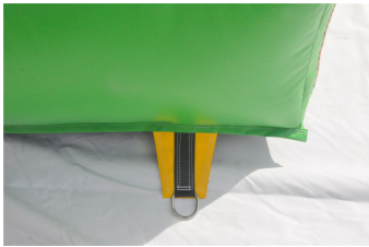
D Shape Anchors