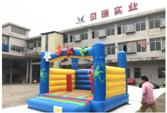
Text Before shipping