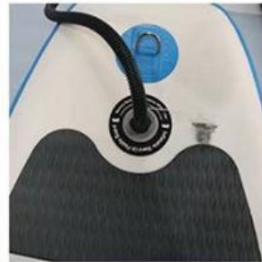
Blow up to 10-12 PSI