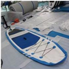
Spread paddle board