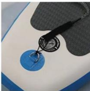
Install the leash