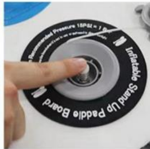
Pop-up valve core