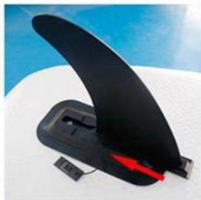
Install the fin