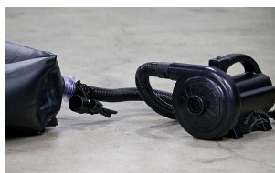
High Quality Pump