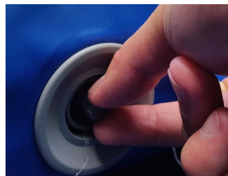
Good Air Valve