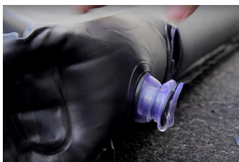
Good Air Valve