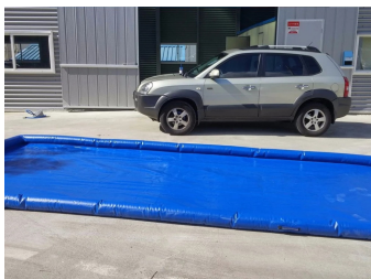
Different Color for Choose