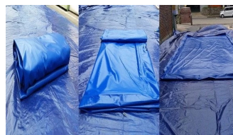
Easy/ fast Setup and Tear Out/Pack