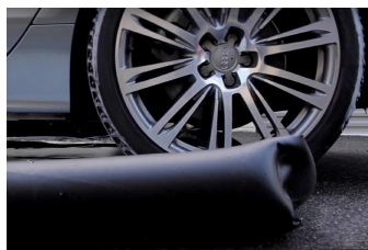
Custom Made as your Car's Size