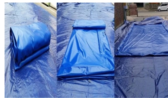
Easy/ fast Setup and Tear Out/Pack