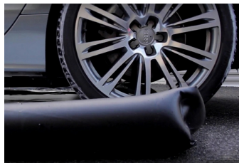
Custom Made as your Car's Size