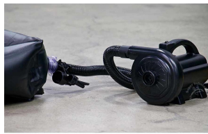
High Quality Pump