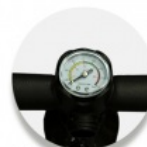
Air Pump W/Gauge

If you are interested in any inflatable products, contact us for quick response! 24 hours online support available! Send e-mail to us!