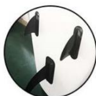
Removable center fin