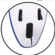
High quality fin