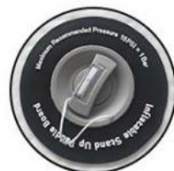
Recommended 10-15 psi