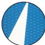
5mm anti-slip EVA pad