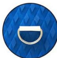
Stainless steel type D-ring