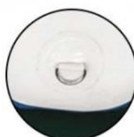
D-ring for dragging and fixing