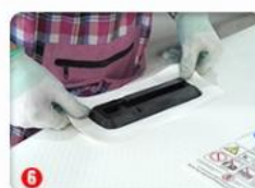
6 Detail decoration