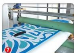
7 Pressure machine to strength EVA.