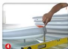
4 Using rocker to measure proper size