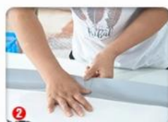
2 Press and fixed PVC