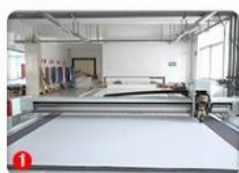
1 Cutting drop stitch material