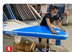
8 QC checking