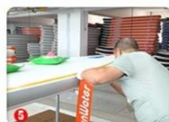
5 Glue the second layer PVC