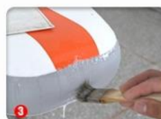
3 Leaking test