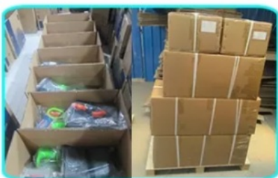
3. Put accessories and packing