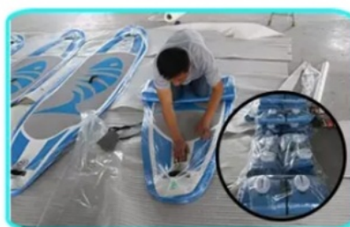
2. Folding and loading bags