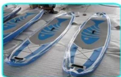
1. Clean & deflation