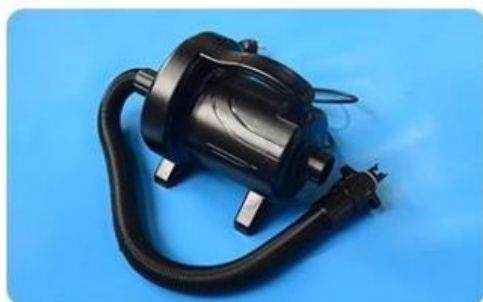
Electric air pump