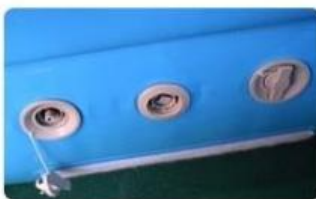
Inflate valve and relief valve