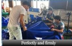
Perfectly and firmly