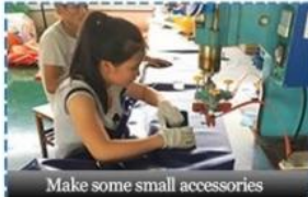
Make some small accessories