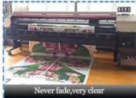
Never fade,very clear