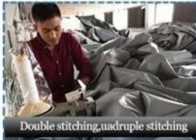
Double stitching,quaduple stitching