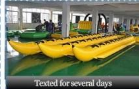
Texted for several days